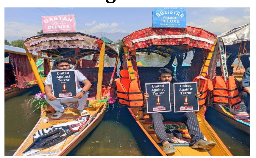
KASHMIR TALK BUREAU SRINAGAR:

In a heartfelt display of solidarity and mourning, students from Jammu and Kashmir studying at Aryans Group of Colleges, Chandigarh, organized a solemn