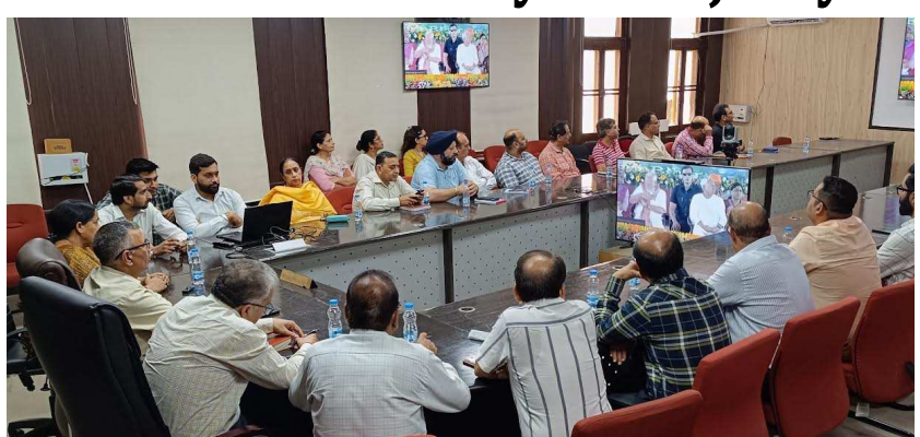
KASHMIR TALK BUREAU SAMBA:

District Administration Samba marked the National Panchayati Raj Day 2025 by organizing an impactful event with overwhelming participation across all levels of local governance.