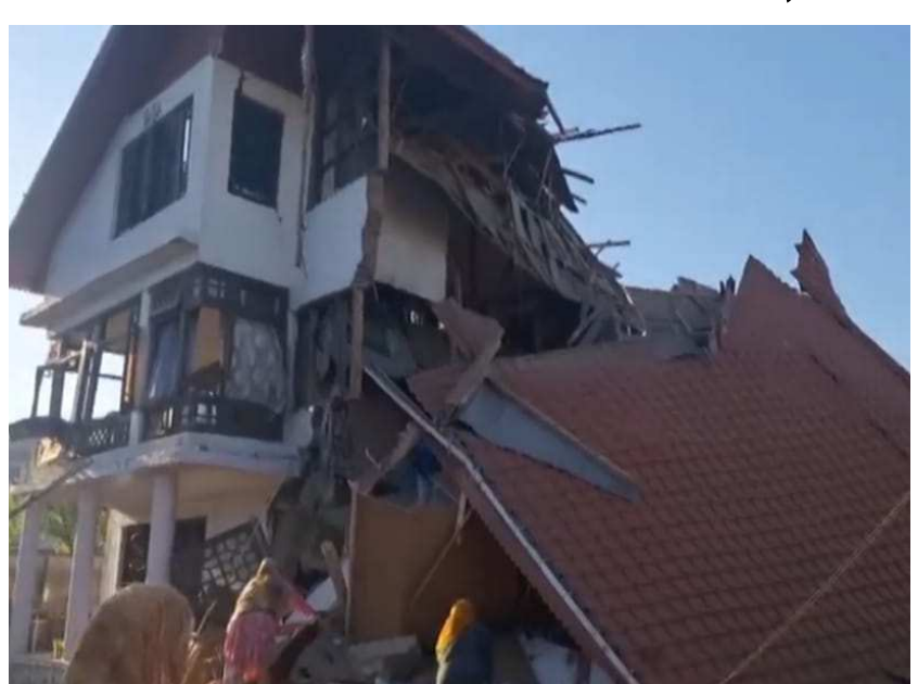
KASHMIR TALK BUREAU JAMMU:

In a significant escalation of counter-terrorism operations following the deadly Pahalgam terror attack on April 22, 2025, which claimed 26 lives, security forces in Jammu and Kashmir demolished four houses linked to active terrorists on Saturday, April 26, 2025. The demolitions, carried out using explosives, targeted properties in Kupwara, Shopian, Bandipora, and Pulwama districts. This action is part of a broader crackdown aimed at dismantling the terror ecosystem in the region, bringing the total number of such demolitions to nine since the Pahalgam attack.