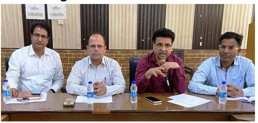
KASHMIR TALK BUREAU RAJOURI:

In line with the recent amendments to the Registration of Births and Deaths Rules, 2022, issued by the Planning, Development & Monitoring