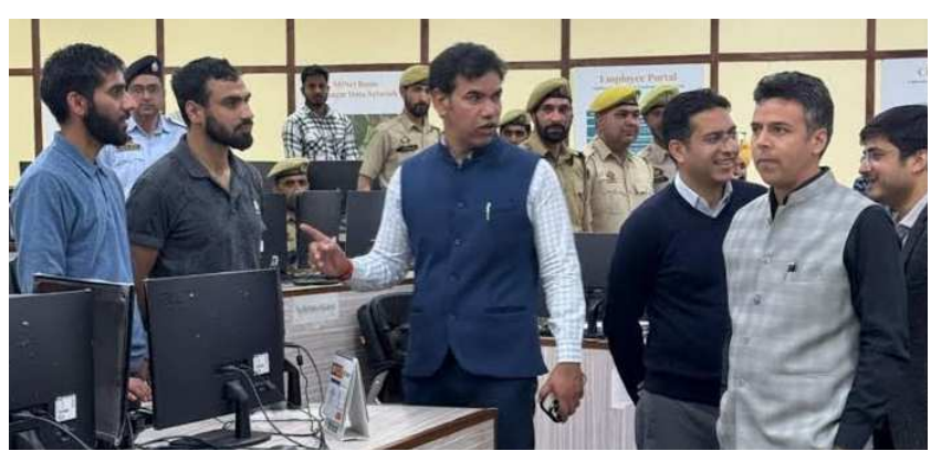
KASHMIR TALK BUREAU SRINAGAR:

In order to educate the masses on the new three criminal laws Bharatiya Nyaya Sanhita, Bharatiya Nagarik Suraksha Sanhita, and the Bharatiya Sakshya Adhiniyam 2023,