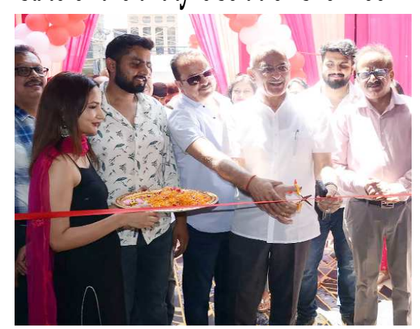
KASHMIR TALK BUREAU JAMMU:

MS Ridefusion, a state-of-the-art tyre solution showroom, was today inaugurated by Sh. Kavinder Gupta, Former Deputy Chief Minister of Jammu and Kashmir. The grand opening marked a significant step in providing high-quality and comprehensive tyre solutions to customers in the region.