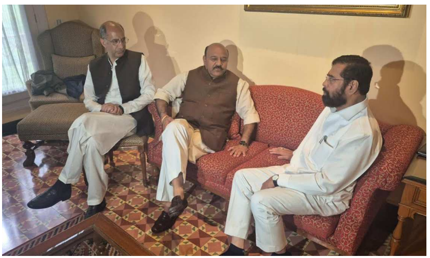
KASHMIR TALK BUREAU SRINAGAR:

Expresses condolences, raises concern for J&K people residing in Maharashtra