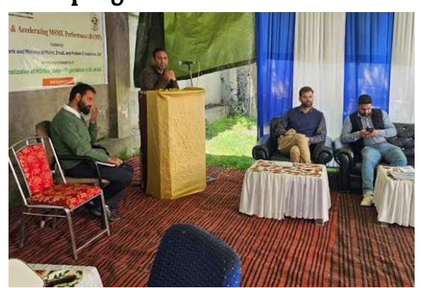
KASHMIR TALK BUREAU SHOPIAN:

The District Industries Centre (DIC) Shopian, under the Raising and Accelerating MSME Performance (RAMP) initiative, organized an awareness-cum-outreach programme at ITI, Shopian today.