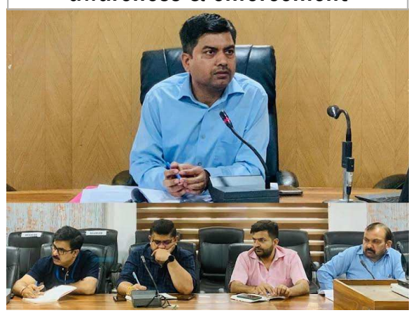
KASHMIR TALK BUREAU KATHUA:

Focuses on curbing drug abuse, awareness & enforcement