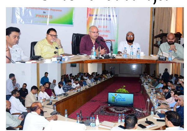
KASHMIR TALK BUREAU RAJOURI:

A one-day District Level Workshop-cum-Awareness Programme on AWAAS Plus 2.0, under the Pradhan Mantri Awas Yojana-Gramin (PMAY-G), was organized at the PWD Dak Bungalow by the District Administration Rajouri in collaboration with the Department of Rural Development and Panchayati Raj. The workshop aimed to provide comprehensive insights into the key features of the scheme, the registration process and strategies for effective and timely implementation.