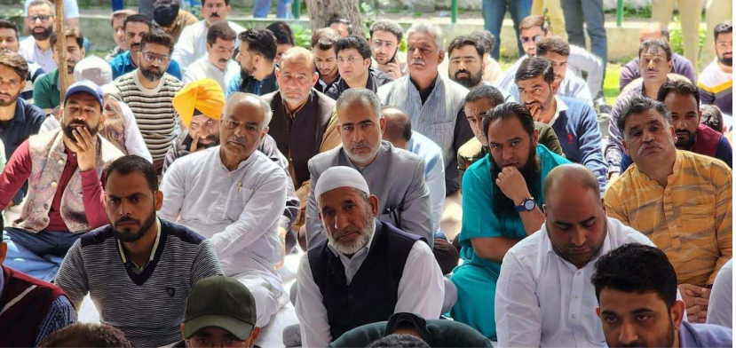
KASHMIR TALK BUREAU

The Bharatiya Janata Party (BJP), Jammu & Kashmir organized a Shradhanjali Sabha at Church Lane, Srinagar, to pay tribute to the 26 innocent civilians who were brutally killed in a terrorist attack in Pahalgam on 22nd April 2025.