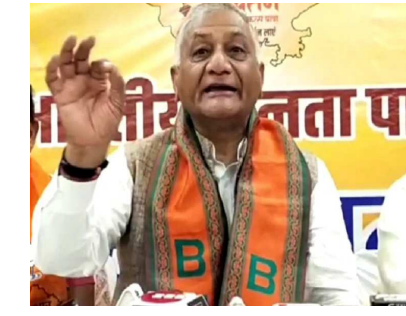
is actively addressing the situation.